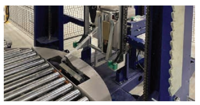
Welding & Cutting device