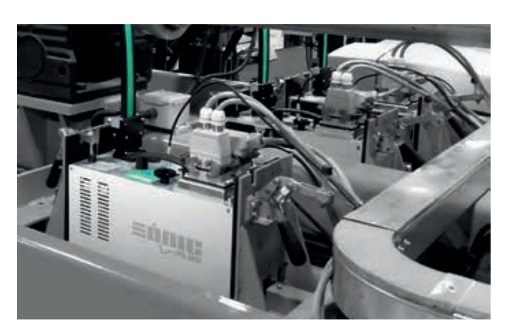
Installation on a vertical strapping machine with press (cardboard application)