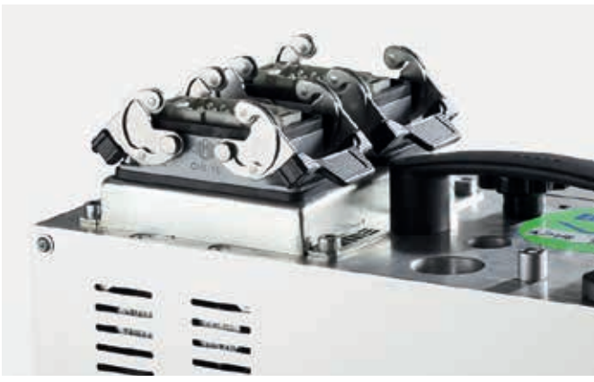
Industrial quick connectors for fast replacement.