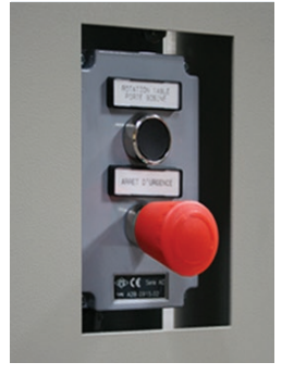
Detail of control panel